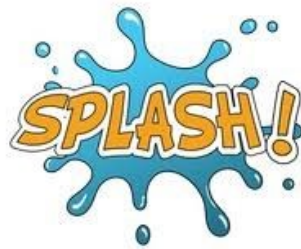
Summer Fun & Surprises

Educators are seeing strong declines in student retention due to an expanded summer break and adjustments in regular instruction this year (distant, hybrid, disruptions during in-person instruction) due to the pandemic.