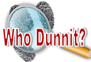
Mysteries and Clues