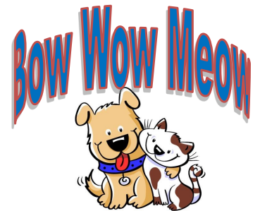
Learning with Cats & Dogs